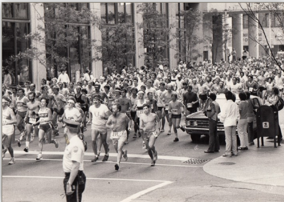
Start of 1983 race at 8th & Locust Street - adjacent to Des Moines Register